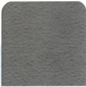
LAYKOLD DARK GREY