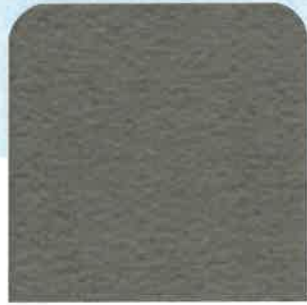
LAYKOLD DARK GREEN