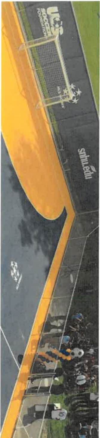
Andrew Jackson Elementary School, Santa Ana CA Soccer Court