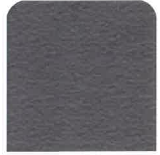
LAYKOLD ROYAL PURPLE