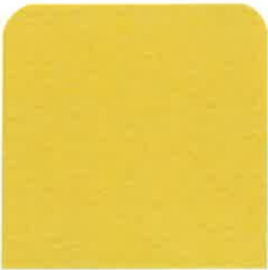
LAYKOLD KEY LIME