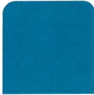
LAYKOLD LIGHT BLUE