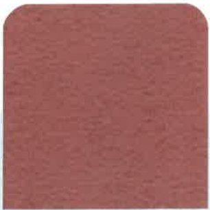
LAYKOLD BRICK RED