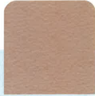
LAYKOLD DESERT SAND