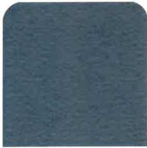
LAYKOLD DARK BLUE