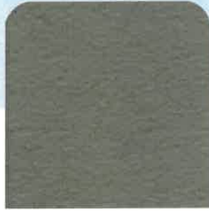
LAYKOLD MEDIUM GREEN