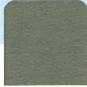
LAYKOLD GRASS GREEN