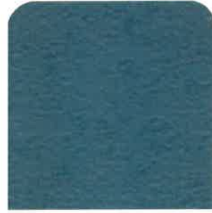
LAYKOLD PRO BLUE