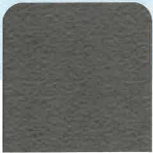
LAYKOLD FOREST GREEN